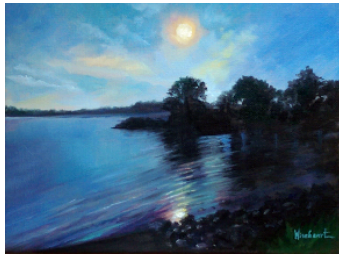
The Window of Northern Express Care 457 Railroad Street

Northern Express Care is featuring a display of woodcut prints from beloved local artist Stephen Huneck. In the front window of the clinic, see the iconic Sally the dog, who was the subject of a number of children's books written and illustrated by Huneck.