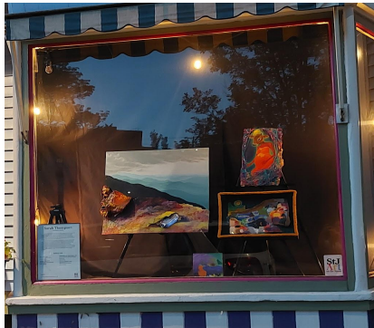
The front window of 142 Eastern Avenue